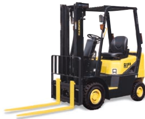
Diesel 1500kg - 2000kg Ranges