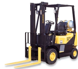
LP Gas 1500kg - 2000kg Ranges